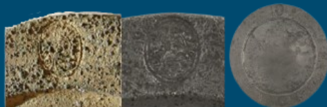
Tin plate, second half of the 17th century. Before and after intervention with electrolytic treatment.

The Oceans are the mainstage for part of man's history and, although they are often a hostile environment of rather abrasive physical and chemical actions, they are also the space in which history is still preserved. However, their discovery often promotes changes in the environment and the degradation of the cultural heritage therein. It is up to the conservator-restorer to challenge the stabilization of underwater archaeological finds, allowing these elements of material culture to be available to the public and researchers. All this work has been developed by the Laboratory of Conservation and Restoration of the Portimão Museum in order to be able to exhibit and/or keep in reserve its collection of underwater archaeological materials.