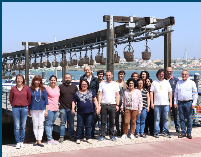
Part of the team at the Portimão Museum, next to the fish unloading hall [Portimão Museum].