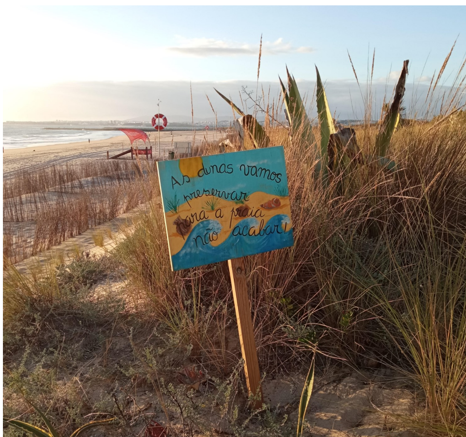
S. João da Caparica Beach, 2020.

These dunes are in the process of rehabilitation, through the plantation of vegetation and the placement of fences and footbridges. The DUNES project is investigating the first interventions, which began at the end of the 19th century, with the aim of fixing these sands.