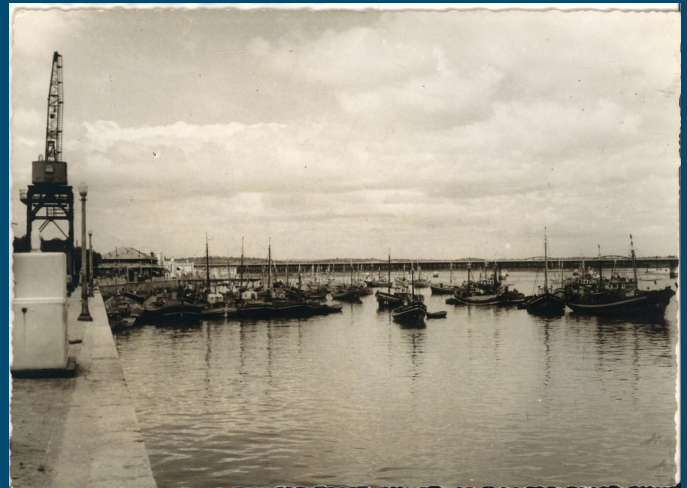
Portimão Harbour.

During the 1930's, the port earned a leading role in the Algarve. In 1931, Portimão exported to England, North America, Germany and France about 11 tons of fish can boxes (400000 units), with a value surpassing other cargo like cork, figs and almonds.