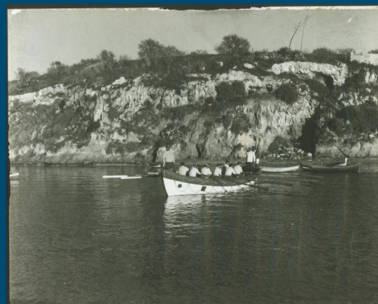
"Alvor" lifeboat

Speaking with former members of the lifeboat crew, we are easily transported to a time where boats propelled by oars or sails were dominant on the local landscape and on which men left town guided by the pole star and the knowledge they gained from experience, learning to distinguish sea wind from north wind... Here and there, stories of strandings and disappearance in the ocean are whispered, together with memories of difficulties to enter the harbour due to the southwest wind that blew or a rather wavy ocean which formed big and dangerous sand banks that preceded the construction of the breakwaters... Women, mothers, wives, daughters tell us about how they managed life at sea from land and the many times they had to run to the beach to help bring in the boats, since men couldn't navigate them through the harbour.