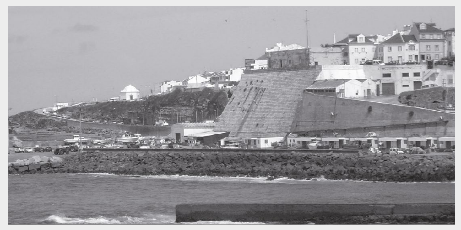
▲ Ericeira beach (2016).

Ericeira is an old fishing place, where, at least since the 12th century, whaling was practiced. It is also famous for being the port from where the Portuguese royal family left the country, after the republican revolution of 1910. Nowadays, it is an interesting nice village, that maintain part of its fishing activities and is, especially during weekends and holidays, a beach destination for people living in the surrounding areas. Many Lisbon's inhabitants have second homes there. In the last years, Ericeira has been much sought for the quality of its waves, being a World Surfing Reserve since 2011. To finish, just one small curiosity: the central plaza in Ericeira is called Jogo da Bola [Ball Game]. It had the same name when Ramalho Ortigão visited it in the end of the 19th century.